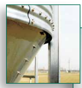
Drip edge directs moisture away from the taper hopper.

Flag System or Feed Line Extensions can be made with the accessories shown to the right.